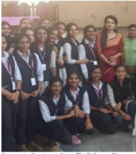
Students and staff of the college