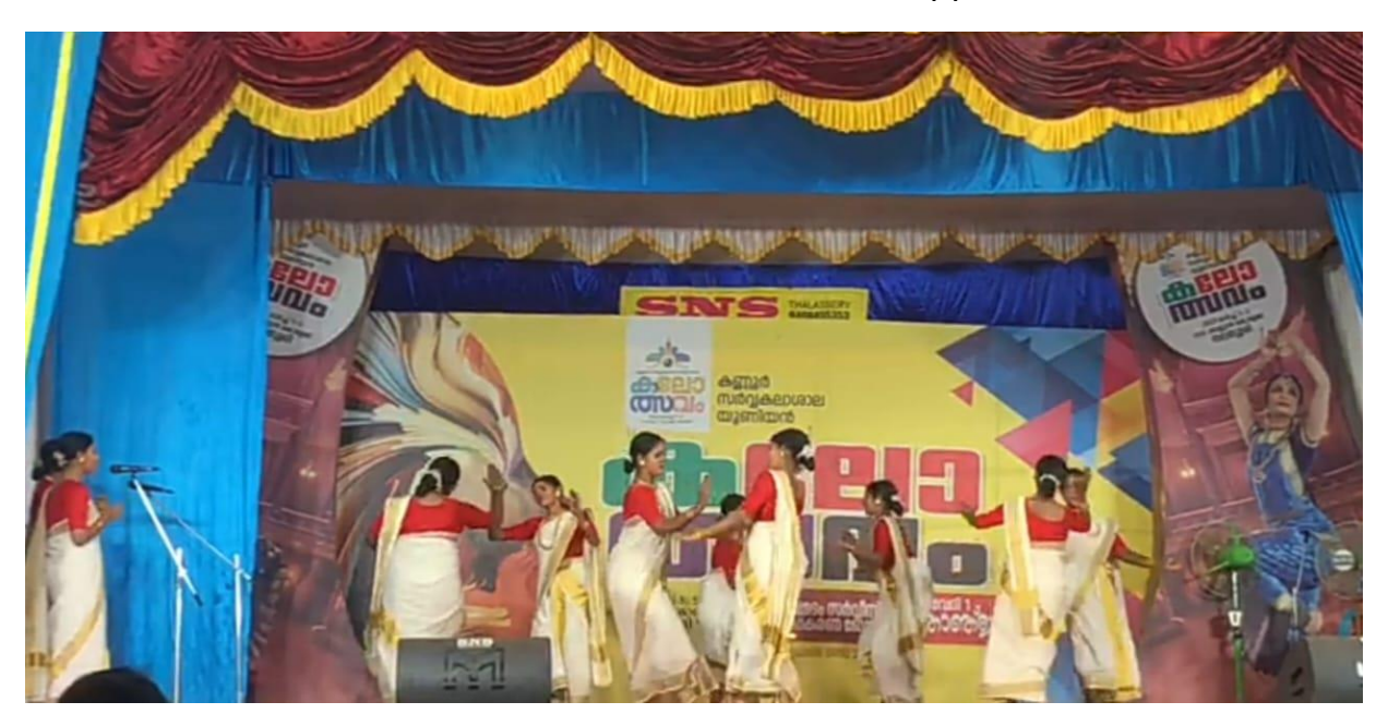
Performance of Hindu Art Form Thiruvathira