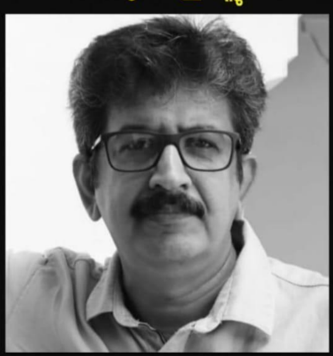
2021 ജൂൺ 19 വൈകുന്നേരം 4 മണി ഗൃഗിൾ മീറ്റ്