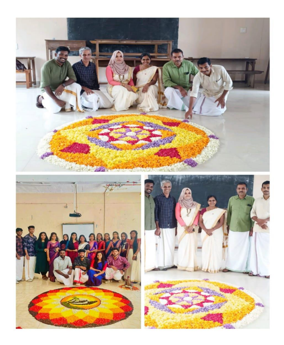
Onam Celebration at EKNM fostering multicultural identities of its members

Cultural events and programmes are hosted by the college to celebrate and educate about different cultures. Onam, Christmas, Diwali, and festivals are celebrated with much fervour. The spirit of oneness is palpable in the very core of the institution. The staff and students believe in celebrating all cultural occasions, particularly of local and national significance like Kerala Piravi, Hindi Diwas etc.