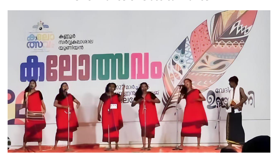
Performance of Folk Song