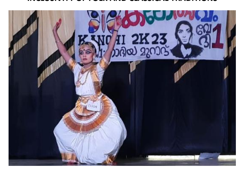
Performance of Classical Dance