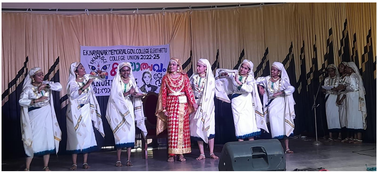
Performance of Muslim Art form Oppana