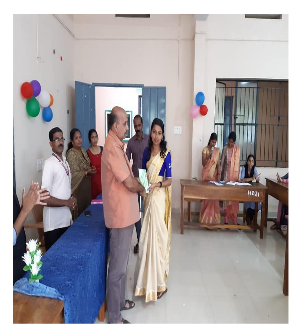
Hindi Diwas at EKNM, organised by the Department of Hindi