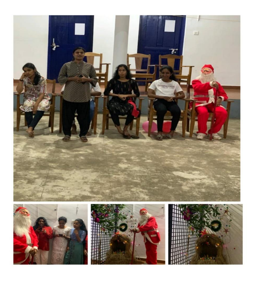
Christmas at Hostel, EKNM