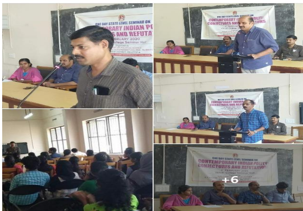
One day state level seminar on 'Contemporary Indian Polity: Conjectures and Refutations' organised by the Dept. of Political Science on 01.02.2020 Ministry of Human Resource Development, Government of India