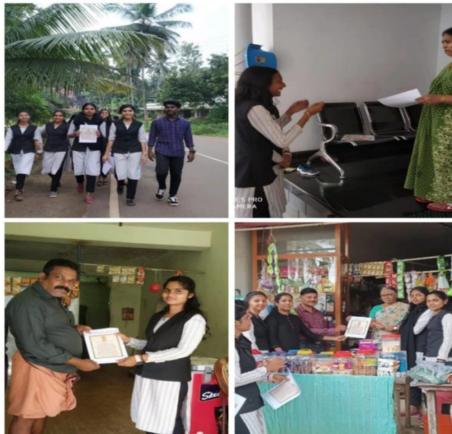
Distribution of Preamble of Our constitution to Public to enhance Civic Sense among Citizens

The College has been initiating its oath to the propagation of communal good every year by means of celebration of Constitution Day. In 2022, it ensured its engagement with the local community by organising an extension activity which involved distributing copies of the Preamble of constitution of India on the 25th of November. With an aim to promote awareness and understanding of the foundational principles of our democracy, students and faculty members embarked on a mission to share preamble with residents in the nearby locality, to various places like markets and community centres. The team engaged in meaningful conversations with people from diverse backgrounds, discussing the significance of the Preamble in shaping the democratic fabric of our nation and nurtured involvement and civic responsibility among the residents.