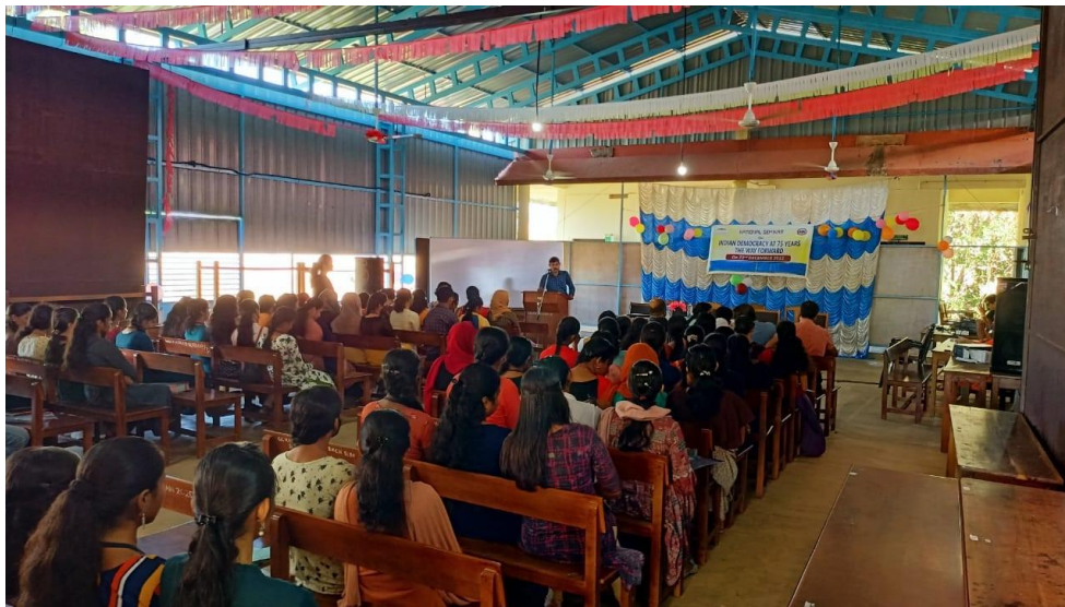
Photograph of Seminar On “Indian Democracy at 75 Years: The Way Forward”