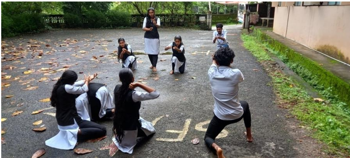
Flashmob - Freedom struggle