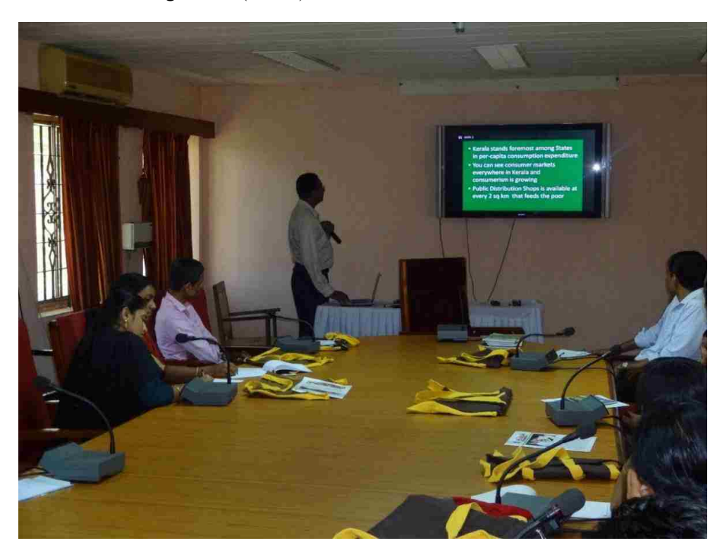
Students interacting with the faculties of KILA.