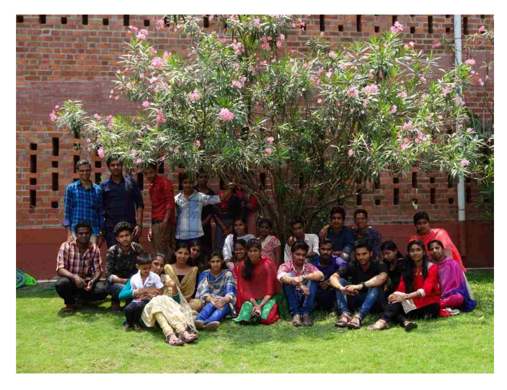
Visit to National Institute of Speech and Hearing (NISH), Thiruvananthapuram by the students of Walk with a Scholar Programme (WWS) on 18/09/2019