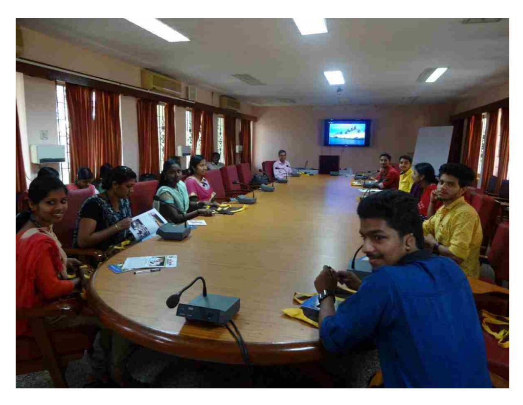
Visit to Kerala Institute of Local Administration (KILA)Thrissur, Kerala, by the students of Walk with a Scholar Programme (WWS) on 18/10/2018