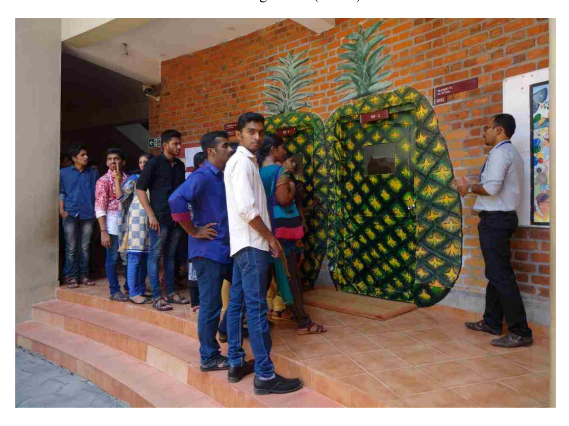
Students interacting with the faculties of NISH