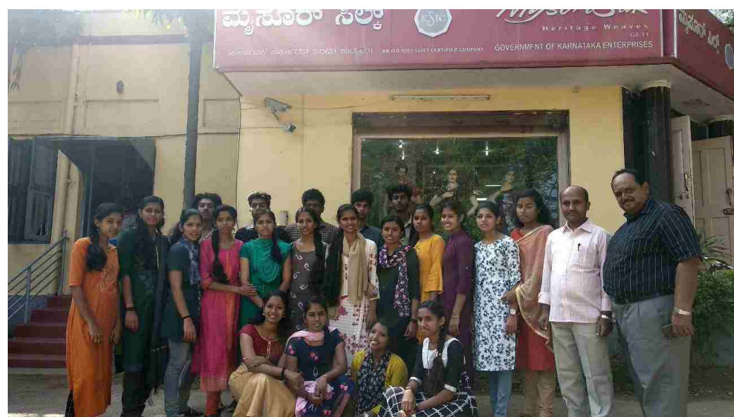
Students of Physics Department Visit Mysore Silk Factory Owned by Karnataka Silks Industries Corporation KSIC as part of Industrial visit on 18/12/2019