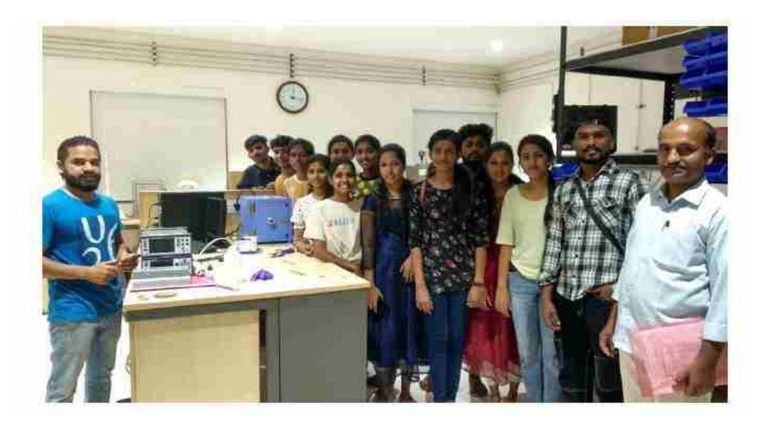
Students interacting with the faculties of Physics Department, BITS Pilani.