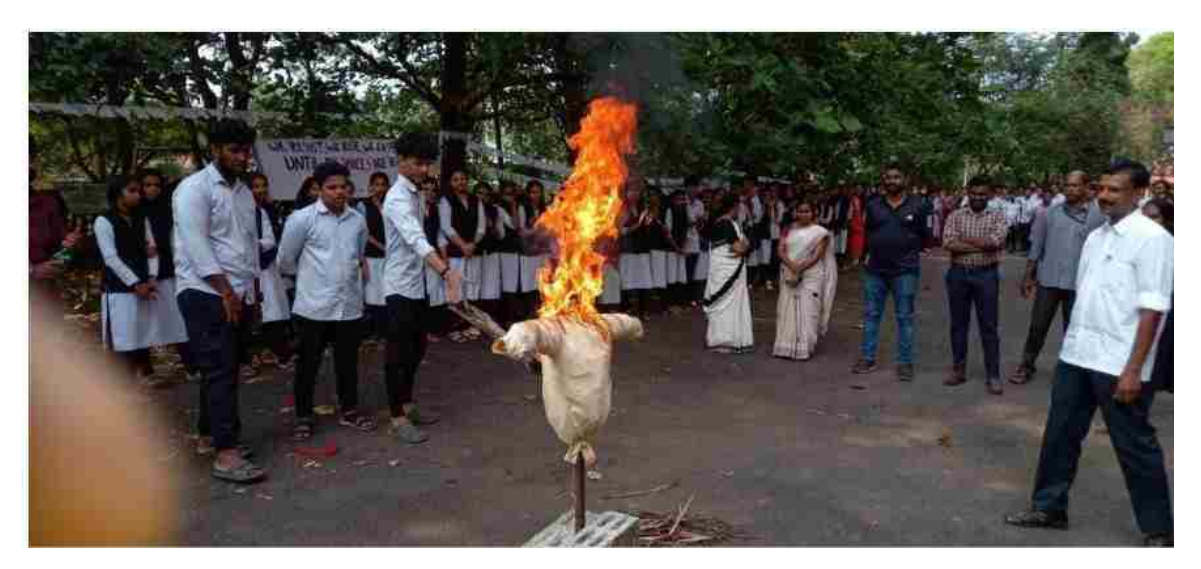
Students Participation in Anti- Drug Campaign Organised by the College Union