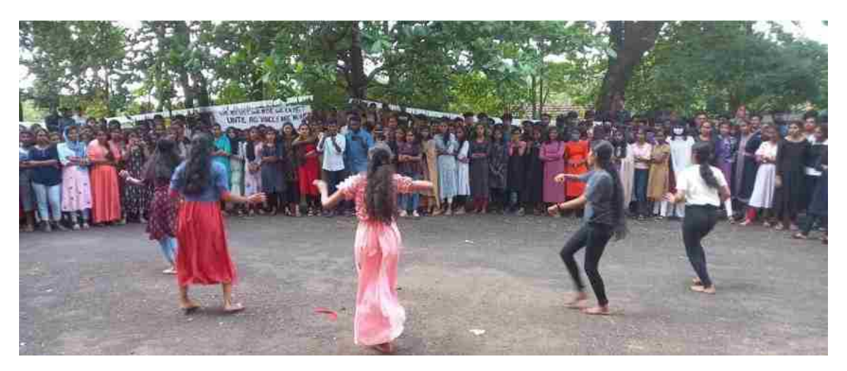
Flash mob to sensitise the problems of Gender Inequality