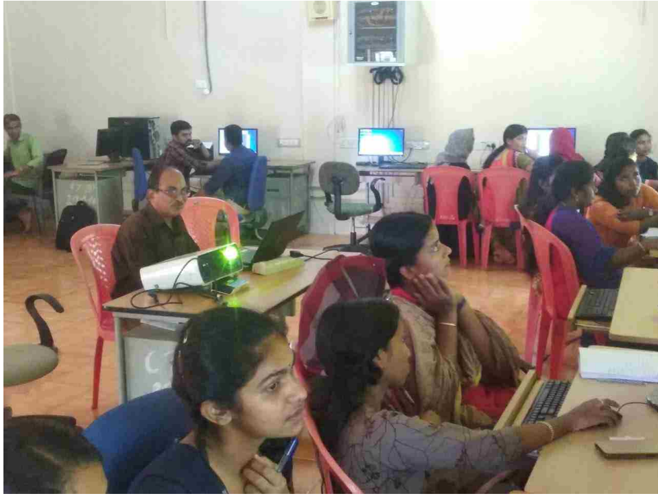
Training Session on Gretl Organised by P G Department of Economics on 23/11/2019