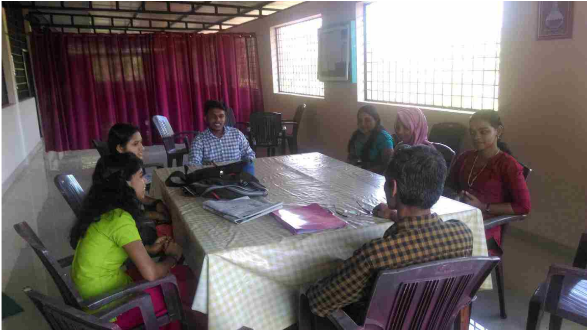
Training on Group Discussion under Walk with a Scholar (WWS) Programme

Participation in debate /discussions promotes problem solving and innovative thinking, and helps students to build links between words and ideas that make concepts more meaningful. In this, students are taught to synthesize wide bodies of complex information, and to exercise creativity and implement different ways of knowing. Participation in debate and group discussions foster open-mindedness, the ability to consider multiple perspective and hones skills in public speaking and rhetoric.