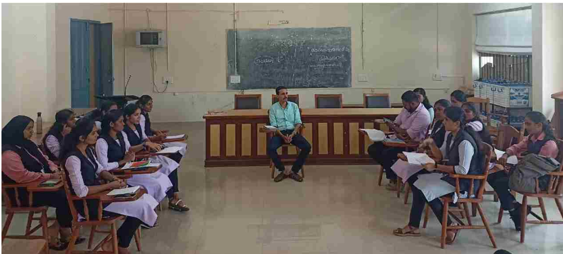
Budget Discussion Organised by P G Department of Economics