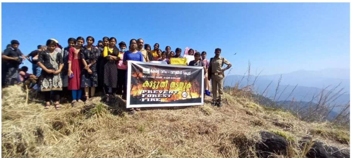
Awareness Campaign on Wild fire organised with the support from Kerala Forest Department.