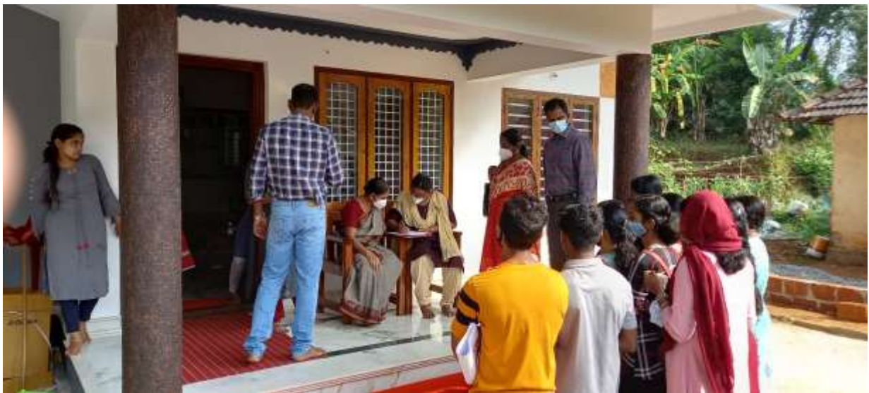
Conducting Digital Survey by NSS Volunteers

Community linked activities/services aims to prepare for their future by helping them to learn what it means to be responsible citizen. Community service teaches students the value of serving others and helps them develop self-discipline and critical thinking skills. By organising different programmes like awareness campaign, social surveys, palliative care activities, blood donation camp, etc students learn by engaging and interacting with their local communities and it adds to their real life experience. A few of such programmes are presented below.