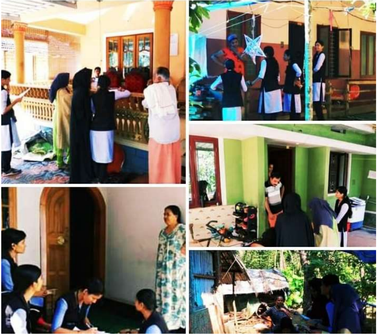
Water Literacy Campaign Conducted by the Students of P G Department of Economics on 16/12/2019