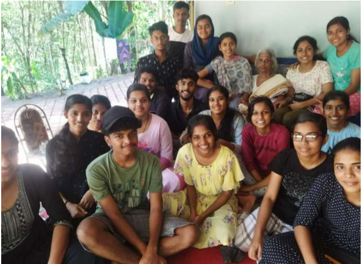
Students having First Hand Experience in Palliative Care Activities.