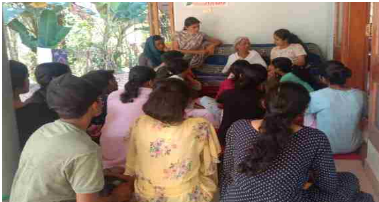
Photograph 15:- Home Visit-Palliative care and Support

To inculcate human values among the students, various programmes have been conducted by the college on a regular basis. Seminar sessions on human values, conducting visits to old age homes, orphanages, participating in the palliative care activities, conducting blood donation camps, raising funds for poor and needy people in the society, etc. are some of the initiatives in this respect.