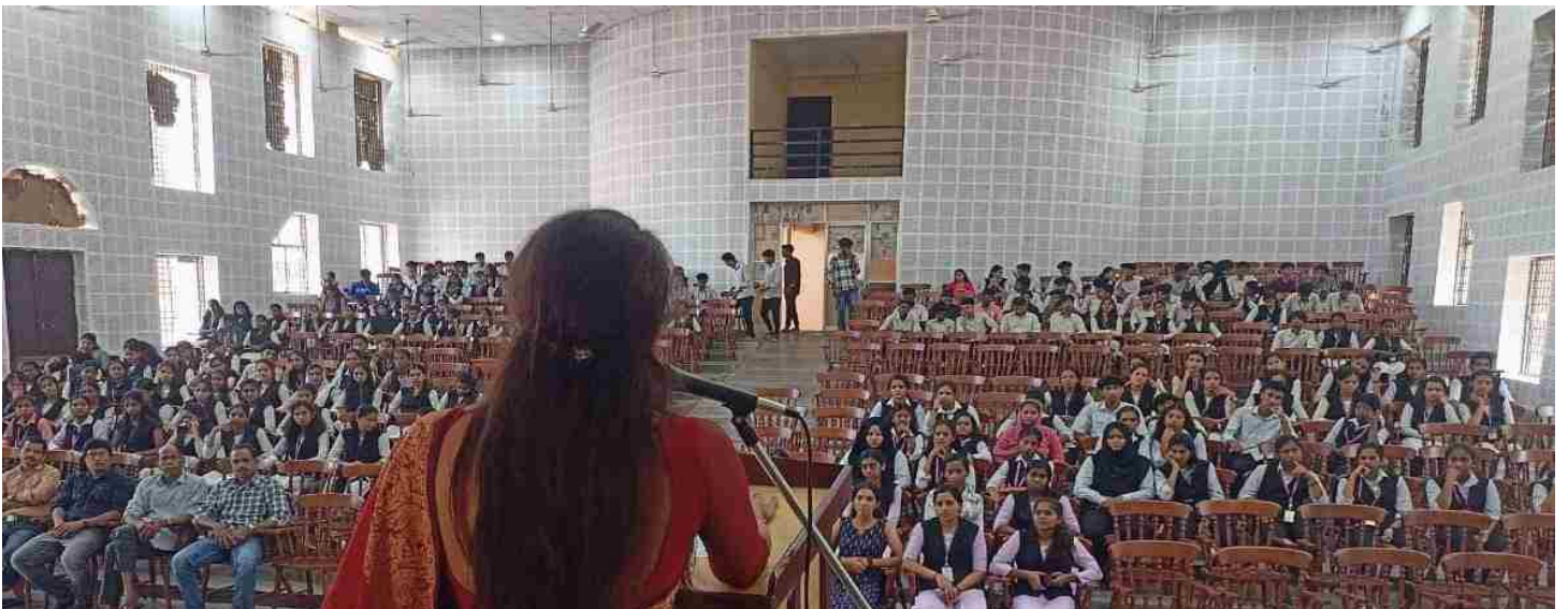
Photograph 3:- Isha Kishore addressing the gathering at college auditorium

The institution conducted an interactive session with Ms. Isha Kishore, a popular Transgender activist on 08/03/2023. Isha Kishore shared her experiences as a transgender person and illustrated the difficulties faced by the transgender community like physical, mental and verbal abuses, isolation, marginalization, poor quality of life etc. Isha Kishore urged our students to fight for upholding the rights of transgenders and queer community and to act as responsible citizens to treat them equally.