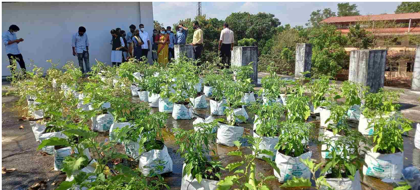
Photograph 9:- Organic Farming – Roof Top of Science Block

In order to foster farming culture resulting in the production of pesticide free vegetables and fruits, organic farming practices are initiated by the NSS units of the college in collaboration with the Krishi Bhavan, West Eleri Grama Panchayath. Organic farming helps the sustainability of agriculture by directly contributing to increased soil health and indirectly the health of flora and fauna. As the students are actively participating in the process of farming, they develop an in-depth knowledge in agricultural practices.