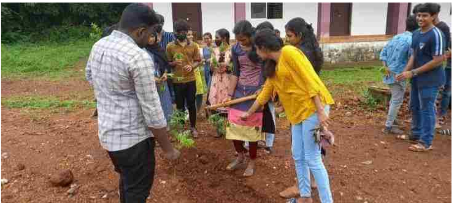
Photograph 7:- Tree Plantation by NSS