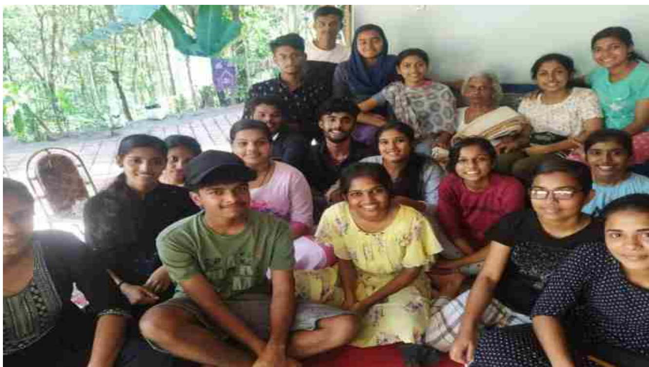
Photograph 16:- Home Visit-Palliative care and Support