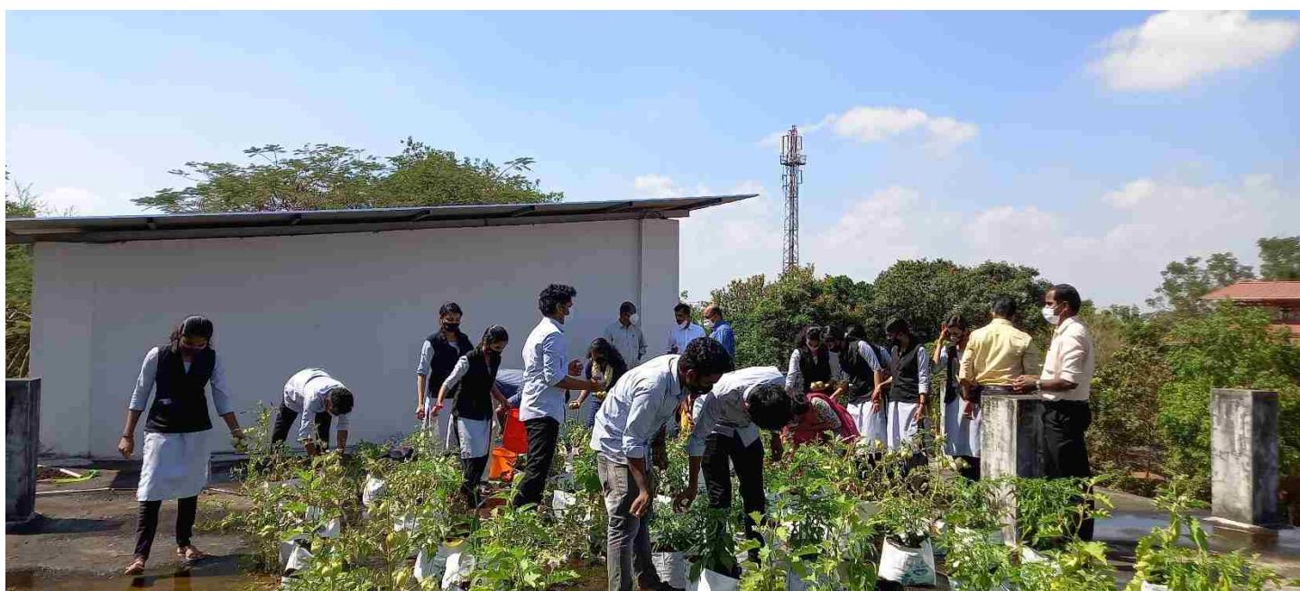
Photograph 10:- Organic Farming – Manuring of Plants