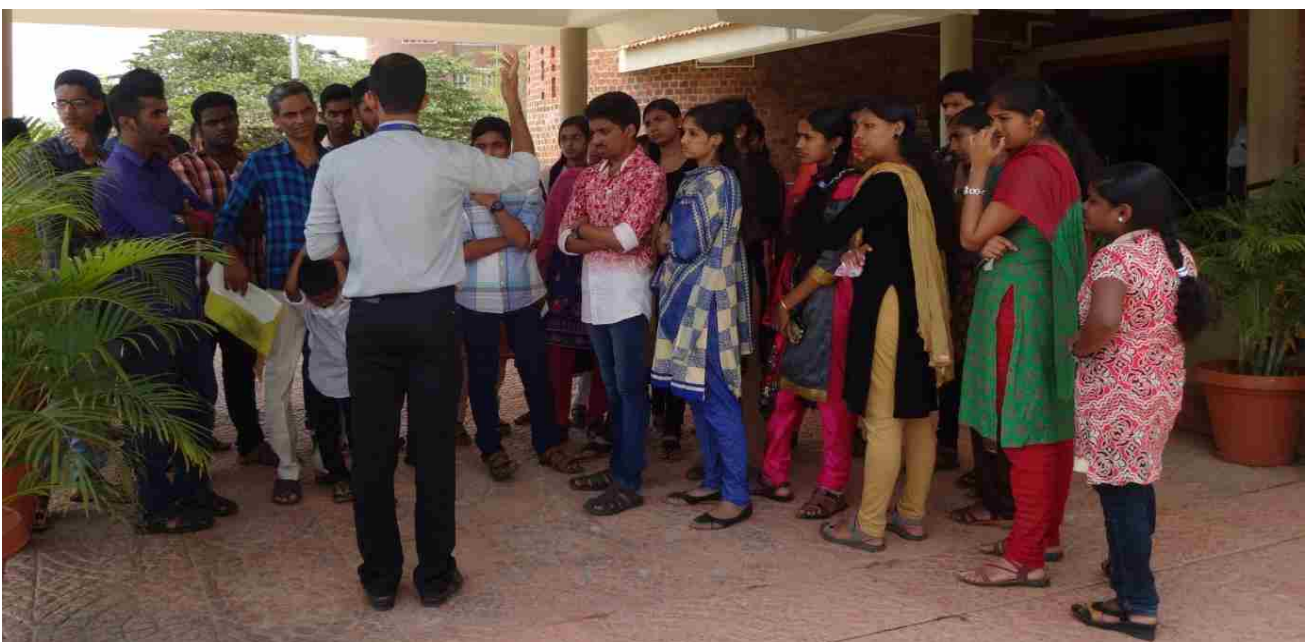
Photograph 14:- Visit to NISH, Thiruvananthapuram by Students of BA Economics.