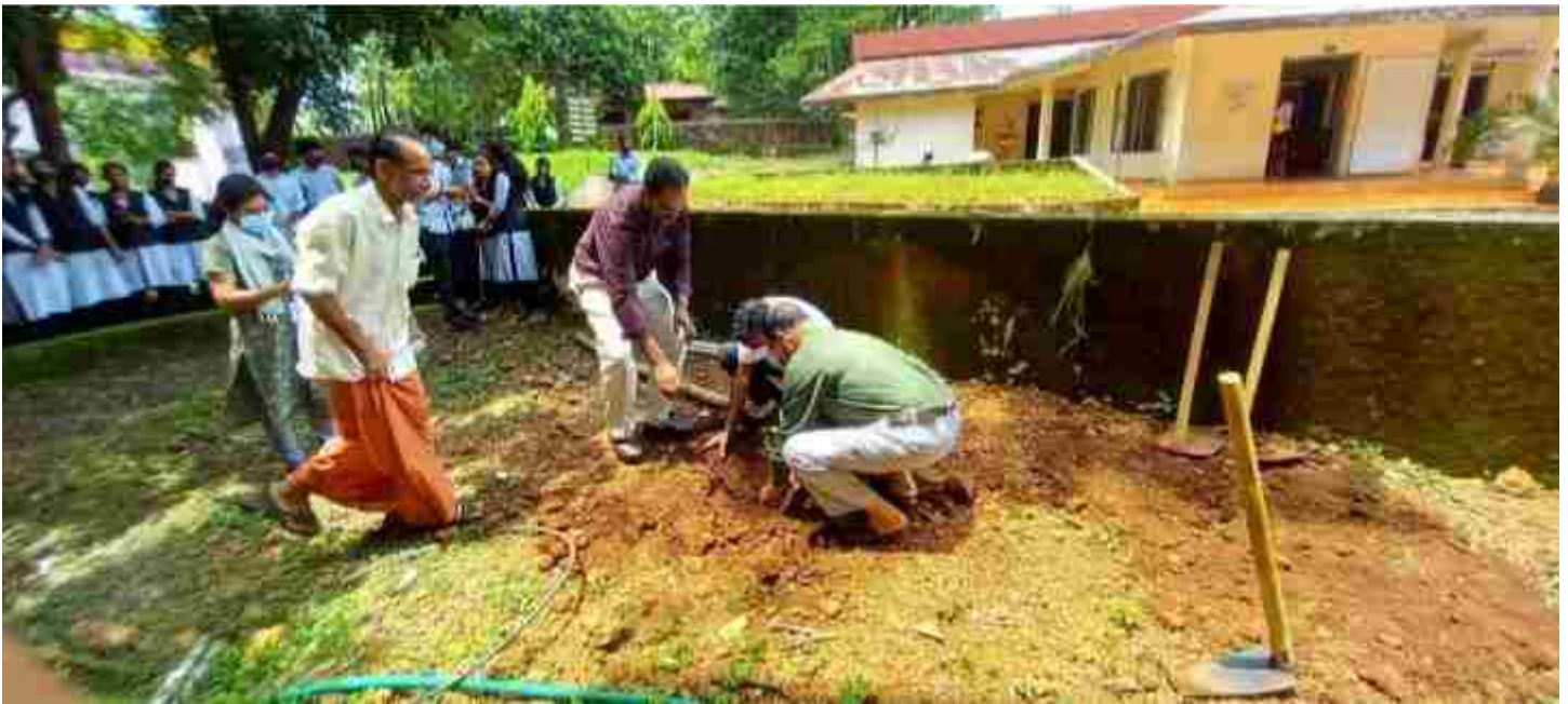
Photograph 6:- Tree Plantation by NSS

By engaging in tree planting activities, students develop a deeper understanding of environmental stewardship, cultivating a lifelong commitment to preserving and protecting nature. Students can learn about the lifecycle of trees, the importance of biodiversity and the interdependence of eco systems. Planting local varieties of tree sapling in the college campus is one among the major activities in this respect. The activity support to preserve, enrich and sustain the green eco system in the campus and it is evident in and around the campus The activity adds the greenery of the campus and at the same time conserves water and the ecosystem in general.