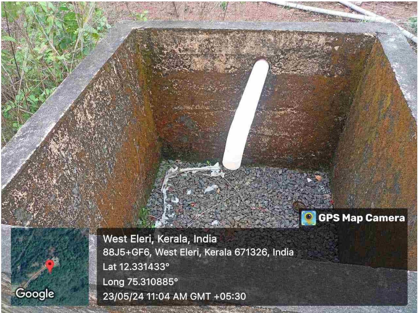
Photograph 8:- Water Harvesting System at Boys Hostel

The college is frequently facing the problem of water scarcity and to address this, rainwater harvesting system has been integrated with Boys' hostel and Library cum Seminar complex. The system is intended to increase the ground water level by allowing the rain water to seep down in the earth during rainy season. Apart from this, water literacy campaigns are being organized every year for the general public residing near the campus.