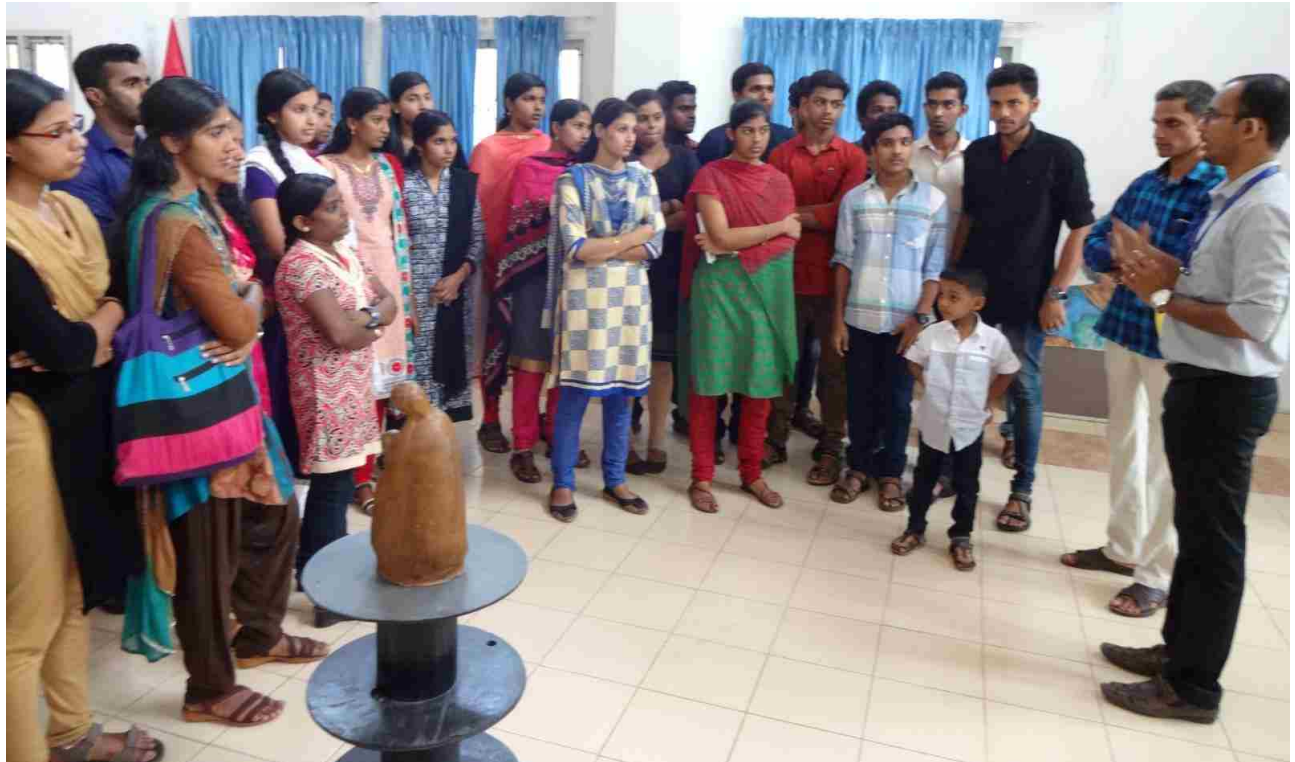
Photograph 13:- Visit to NISH, Thiruvananthapuram by Students of BA Economics.

To understand the problems faced by the differently abled persons having difficulties like speech and hearing impairments, locomotor disabilities, psychological disorders etc., the college conducts visits to different institutions addressing these issues. As part of these activities, a visit has been organized to the National Institute of Speech and Hearing (NISH), Thiruvananthapuram in the month of October 2019. The exposure to such a national level institution was an eye opener to the students.