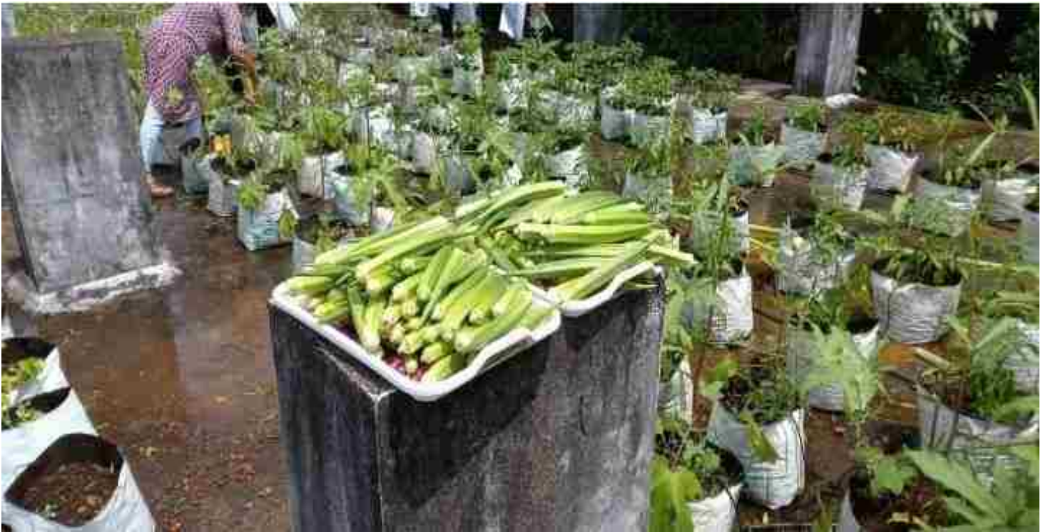
Photograph 11:- Organic Farming – Vegetable Harvesting