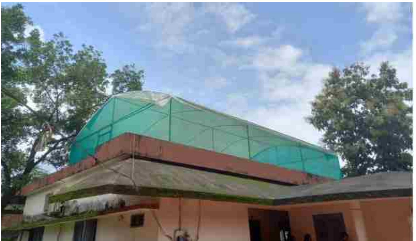
Photograph 12:- Poly House Farming on the roof top of canteen